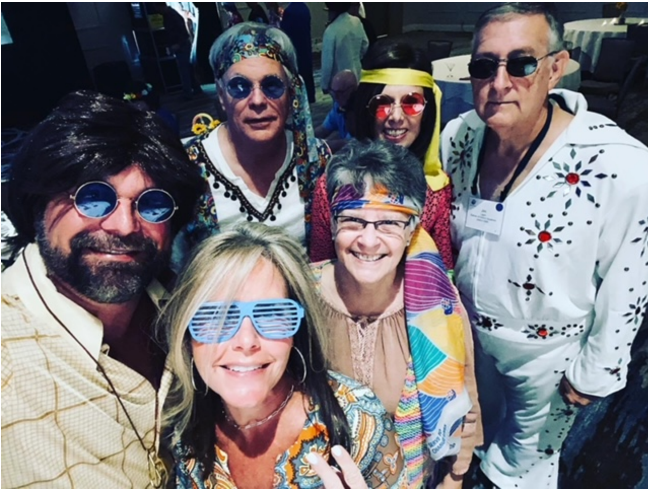
Posted by Mary Ligon October 4, 2021