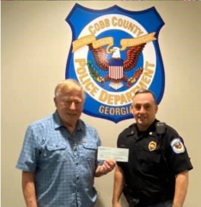
Posted by Jackie Cuthbert October 5, 2021