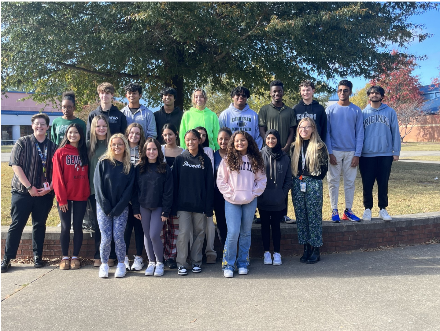
Posted by Nancy Prochaska October 28, 2023