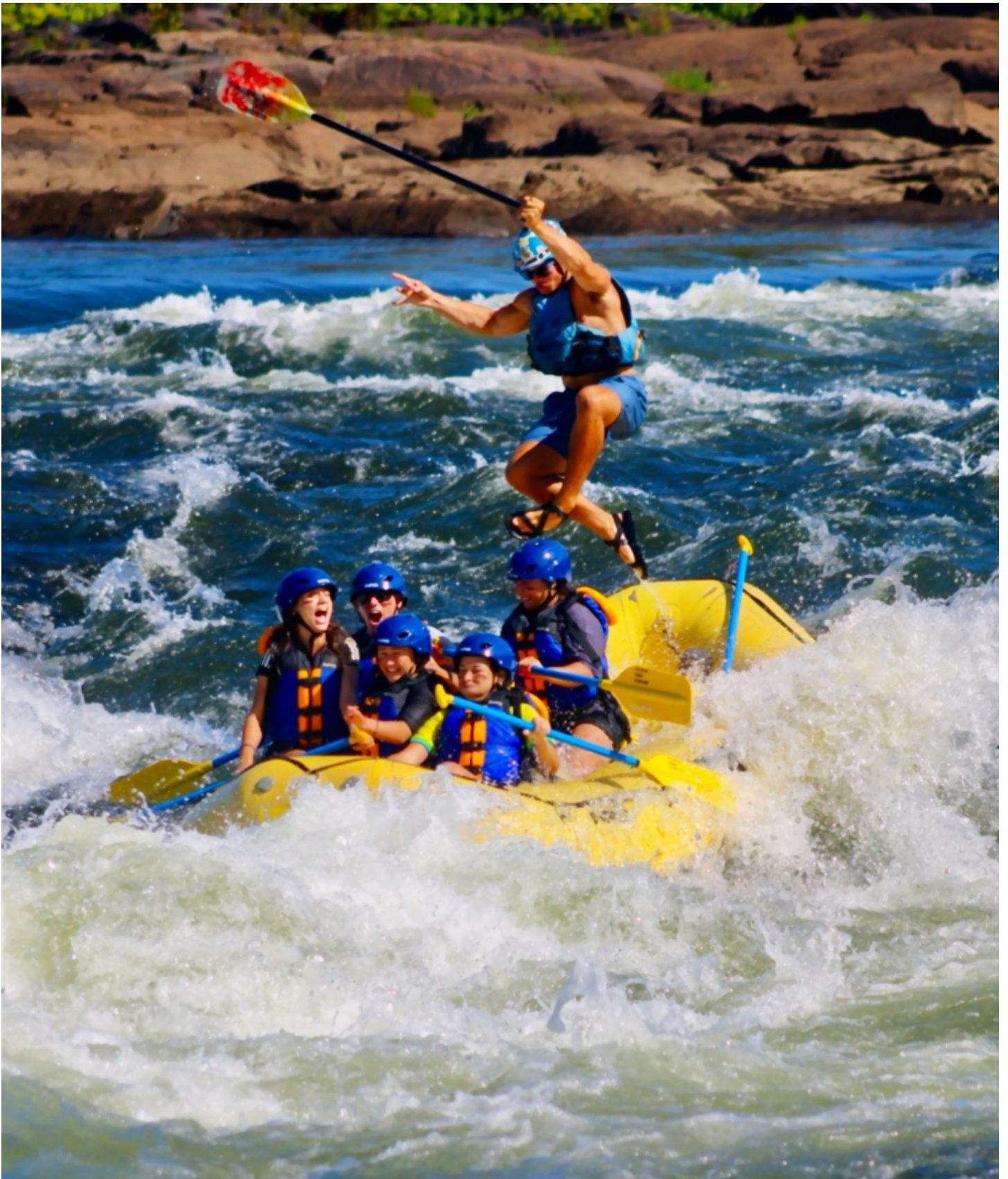
Posted by Kathyeryne Fields August 28, 2024