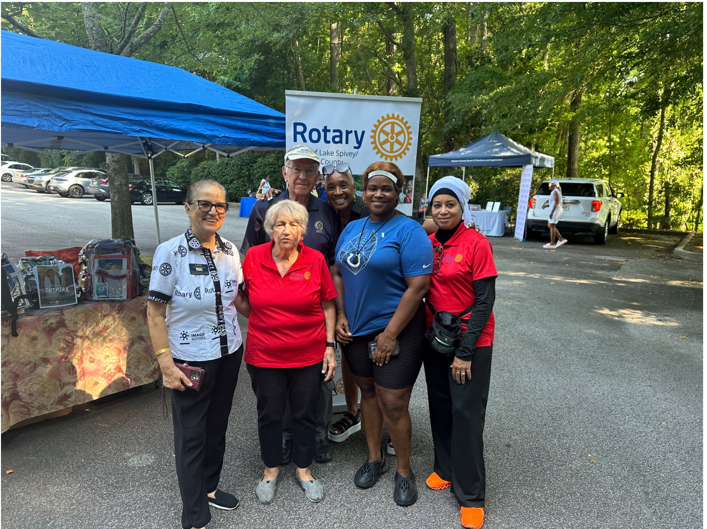
Posted by Gerrian Hawes July 24, 2024