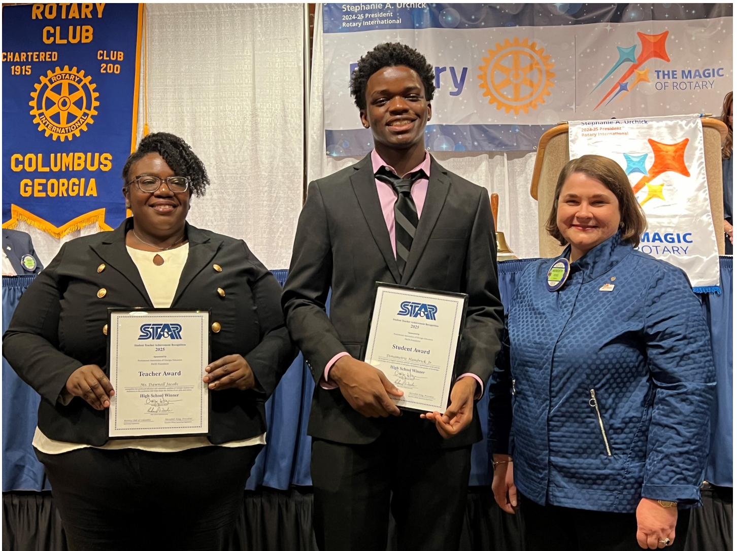
Posted by LeighAnn DiCesaris March 2, 2025