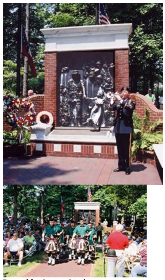
Posted by Lynne Lindsay