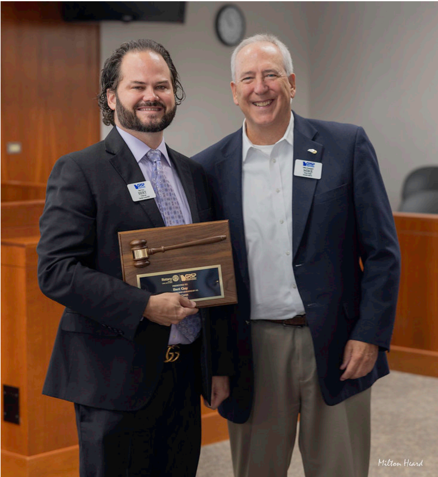
Posted by Kathy Fields July 26, 2022