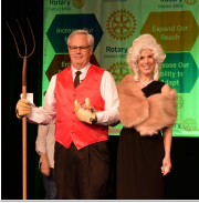
Rotary Club of Atlanta Honors ... High Up Today! The Rotary Club of Atlanta has honored a group of individuals for their contributions to the community. The awards were presented at a luncheon held at the Ritz-Carlton Hotel in Atlanta on March 21, 2023.