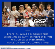
Rotary Club of Atlanta Supports ... High Up Today! The Rotary Club of Atlanta has supported a group of individuals for their contributions to the community. The awards were presented at a luncheon held at the Ritz-Carlton Hotel in Atlanta on March 21, 2023.