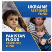
Rotary Club of Atlanta Supports Ukraine and Pakistan Relief Efforts The Rotary Club of Atlanta has supported relief efforts for Ukraine and Pakistan. The club has provided financial assistance and organized fundraising events to support these efforts.