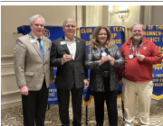
Rotary Club of Atlanta Honors ... More Important Than We Can Imagine The Rotary Club of Atlanta has honored five individuals with awards for their contributions to the community. The awards were presented at a luncheon held at the Ritz-Carlton Hotel in Atlanta on March 21, 2023.