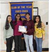
2022 District Award Day 10th Review

We are proud to announce the 2022 District Award Day. This is a special occasion where we recognize the achievements of our clubs and districts. We encourage all clubs and districts to participate and share their stories. The award day is a great opportunity to celebrate our success and inspire others.