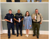
2022 District Award Day 10th Review

We are proud to announce the 2022 District Award Day. This is a special occasion where we recognize the achievements of our clubs and districts. We encourage all clubs and districts to participate and share their stories. The award day is a great opportunity to celebrate our success and inspire others.