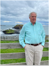
Thank You to Our 2022 Club and District Leaders and to Their Teams

As we close out another year of service, we want to express our heartfelt appreciation to all the club and district leaders who have served us with dedication and passion. Your leadership and commitment have made a significant difference in our community and the world. We are proud to have you as part of our team and look forward to continuing our work together in the future.