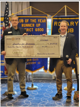
2022 District Award Day 10th Review

We are proud to announce the 2022 District Award Day. This is a special occasion where we recognize the achievements of our clubs and districts. We encourage all clubs and districts to participate and share their stories. The award day is a great opportunity to celebrate our success and inspire others.