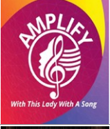
Area 13 Amplify Rotary at 2022 District Conference - Registration Open

We are excited to announce the 2022 District Conference and Collaborative Community Grant Search. This is a unique opportunity for our clubs and districts to come together and identify grant opportunities that will benefit our community. We encourage all clubs and districts to participate and share their ideas and insights.