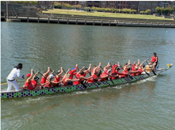
Posted by Claudia Mertl October 28, 2023