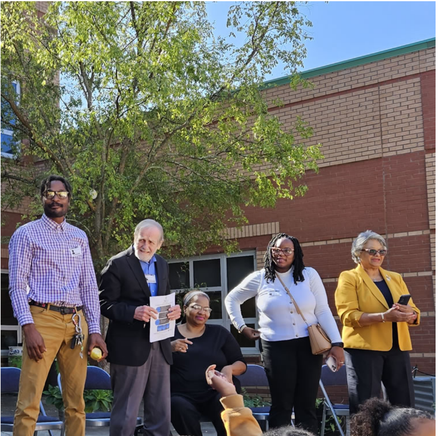
Posted by Neil Shorthouse October 29, 2023