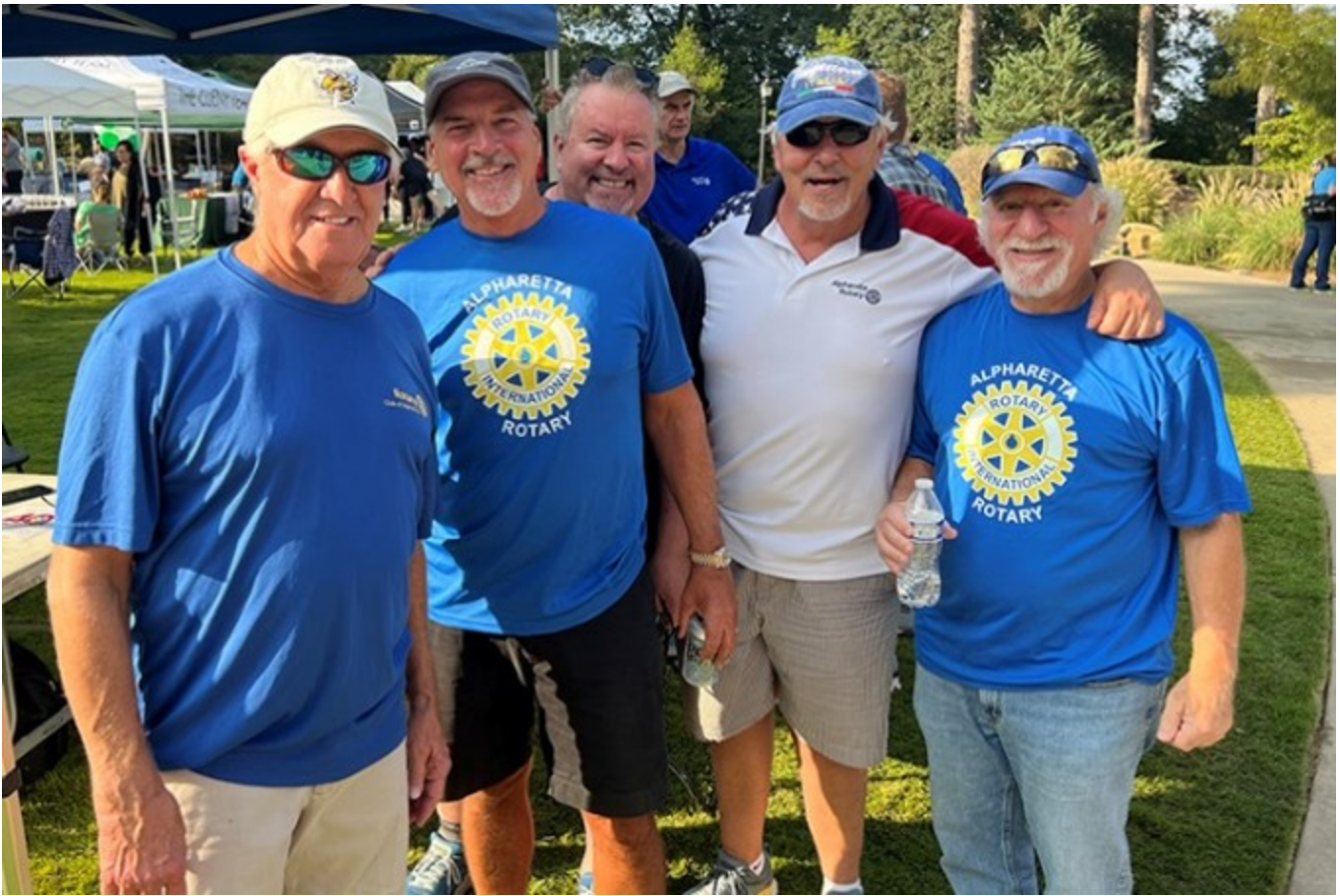
Posted by Clark Savage October 30, 2023