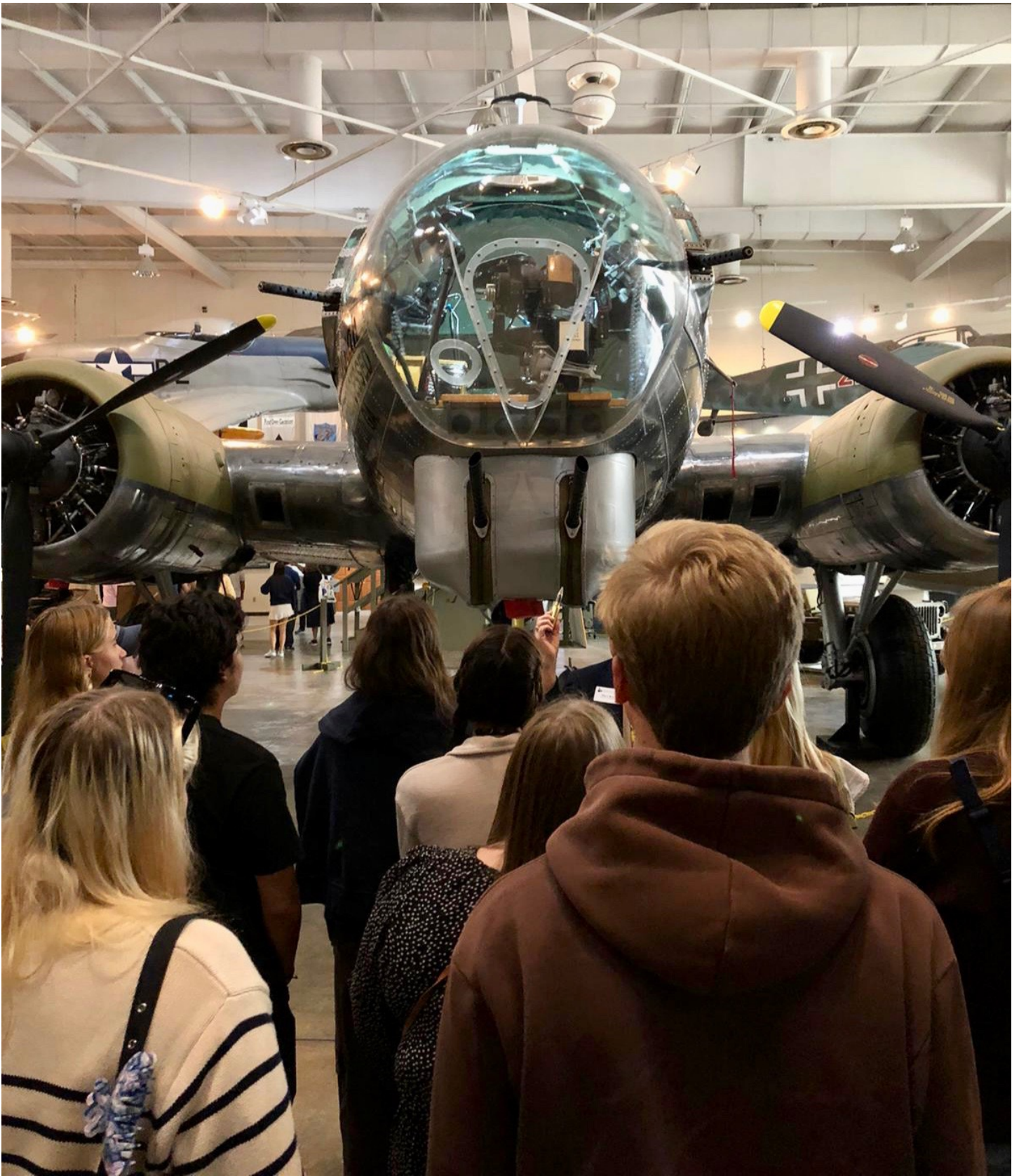
Posted by Katheryne Fields October 30, 2023