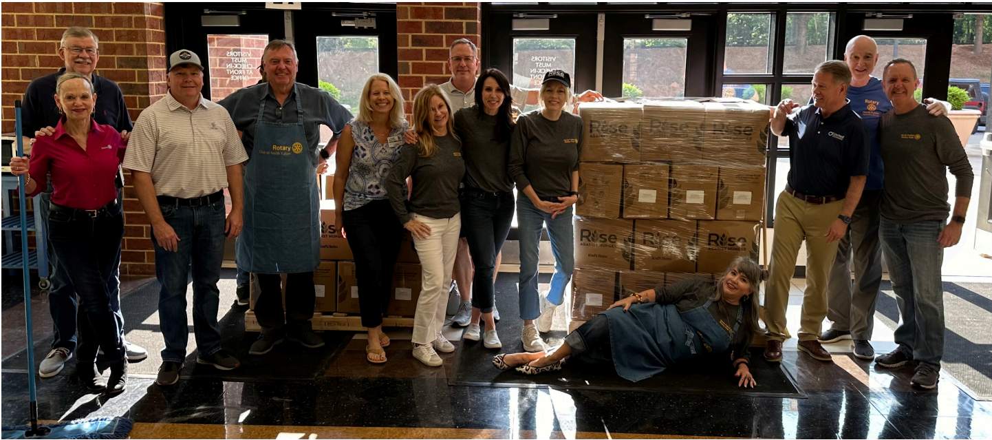
Posted by Lisa Gelber May 5, 2024