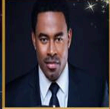
Actor Lamman Rucker