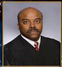
Dekalb Co. Judge Gregory A. Adams