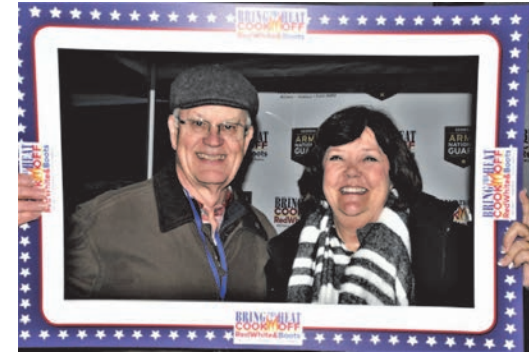
The Red, White & Boots BBQ competition that benefited the Georgia National Guard Foundation, the Cobb County Public Safety Foundation and the Veterans Court of Cobb County/Bravo/Victor Fund.

Red, White & Boot Service Project November 14, 2019