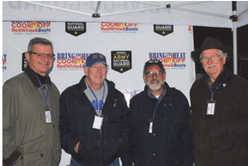
Club members donated their time to assist at the Red, White & Boots BBQ competition fundraiser.