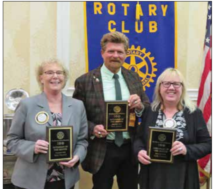
ROTARIANS OF THE MONTH!